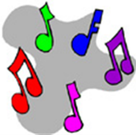
Musical Intelligence or Music Smart

In the workplace, the people who require linguistic intelligence include: poets, public speakers, script and speech writers, comedians, and television announcers.